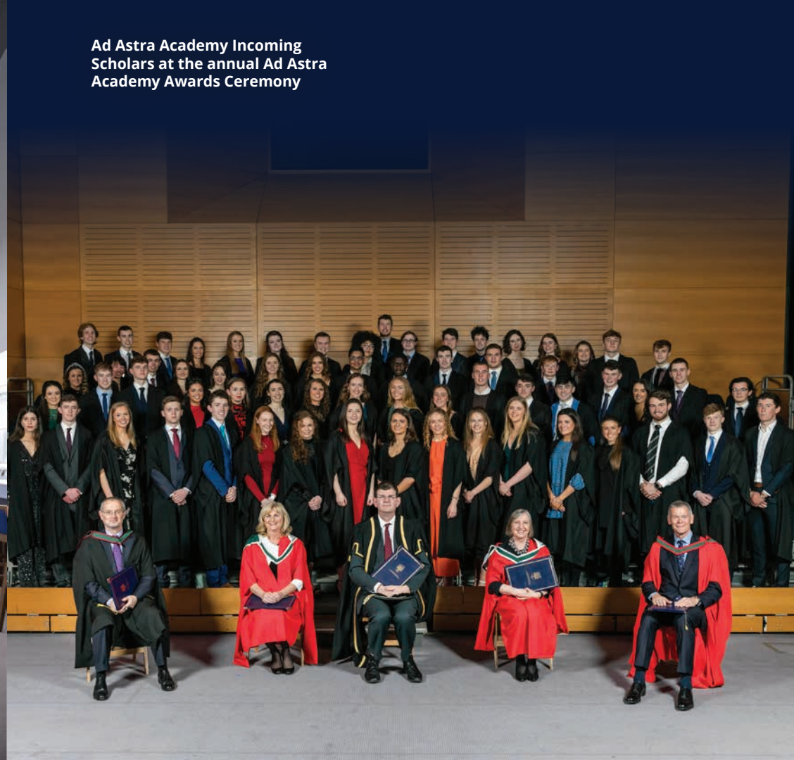
Ad Astra Academy Incoming Scholars at the annual Ad Astra Academy Awards Ceremony

At the UCD Ad Astra Academy we are proud to have helped some of Ireland's greatest talents from all across the country to excel. We are currently looking for exceptional students to join our programme for 2022 and reach new heights. We need your help to find them.